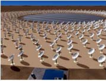
Download hi-res JPG - size 6 689 KB