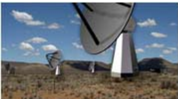
A close-up view of four of the 20 dishes of the Karoo Array Telescope, with the control room in the background.