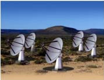
An artist's impression of the twenty dishes of the Karoo Array Telescope on site near Carnarvon in the Northern Cape. Each of the 20 dishes will be 15 m in diameter and about 19 m high.