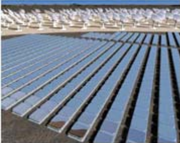
Download hi-res JPG - size 1 317 KB